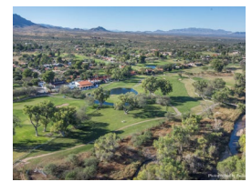
Tubac Golf Resort and Spa, Tubac, AZ.