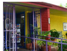
Nogales Visitor and Tourism Center