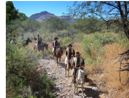
De Anza Days in October. Costumed Re-enactment.