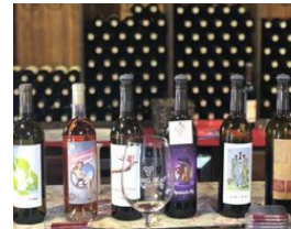
Flying Leap Vineyards – Tubac Tasting Room