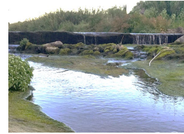
Santa Cruz River, Santa Cruz County.