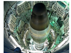
Titan Missile Museum, National Historic Landmark.