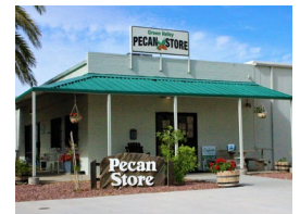
Green Valley Pecan Store, Sabuarita, AZ.