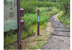
Madera Canyon Trail, US Forest Service.