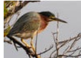
Green Heron, Permanent but Rare to see on the Historic Canoa Ranch Lake.